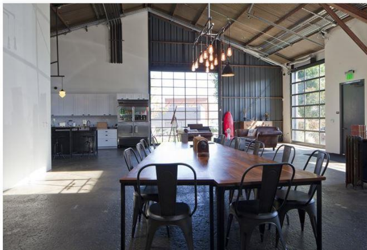
Genton Property Group is repositioning the bLackwelder creative office campus in Culver City, Calif.

As Genton has observed in L.A., investment strategies tend not only to differ by horizon but also by property type. “We still like office, generally. What would normally be a core to core-plus kind of idea depends on investors. There are higher-yield investors who will seek something a bit more robust, with a value-add (component).”