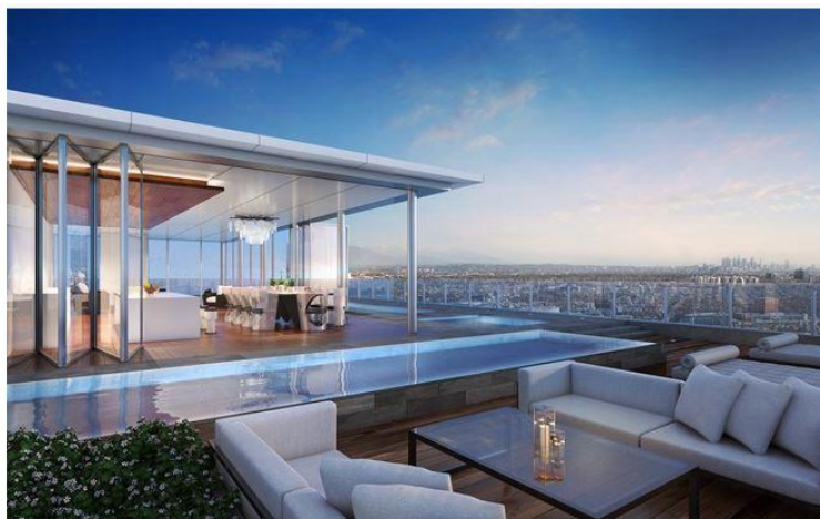
A penthouse at the Four Seasons Los Angeles Private Residences offers sweeping city views.